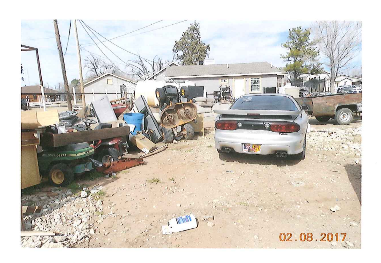
4/13 N Selman