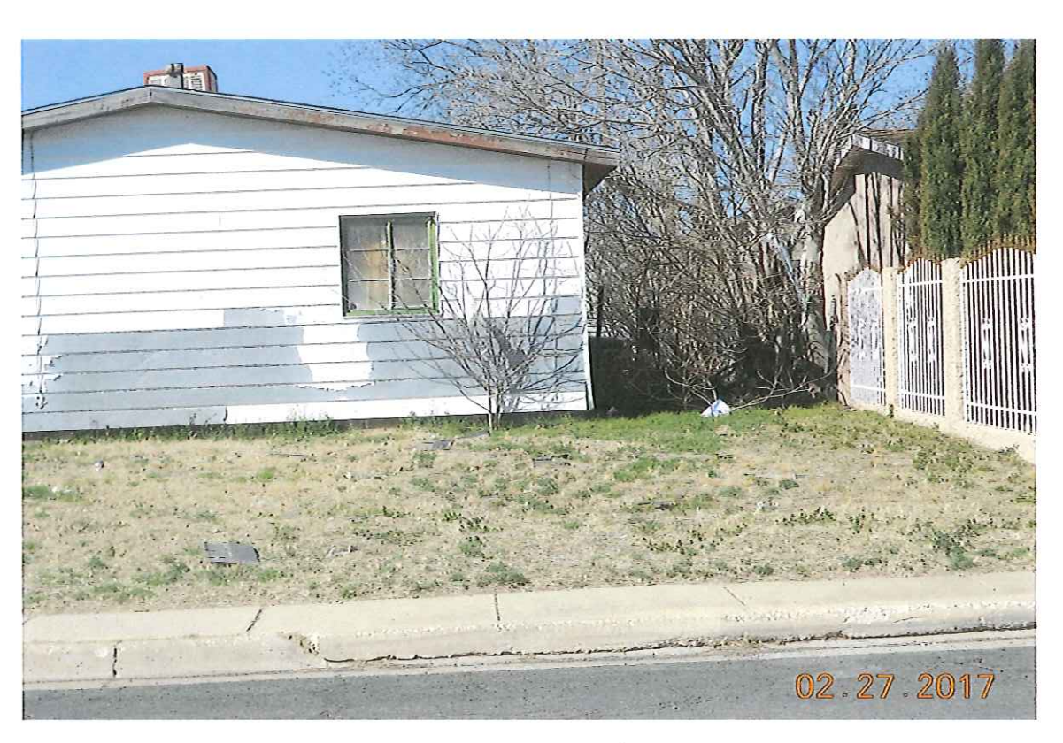
1304 w Sanger