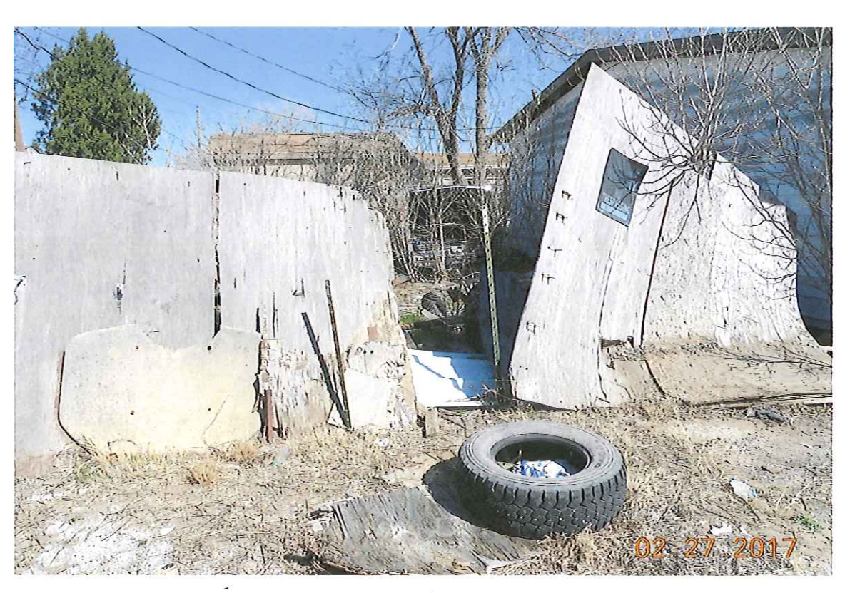
1304 W Sanger