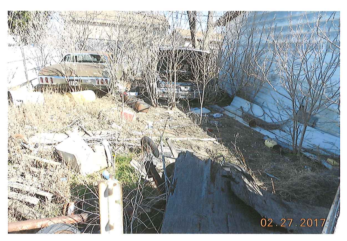
1304 w Janger