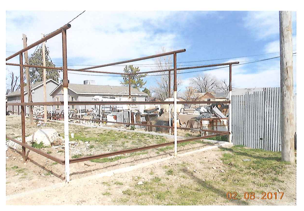
413 N Selman