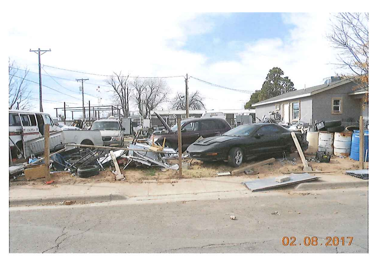
413 n. Selman